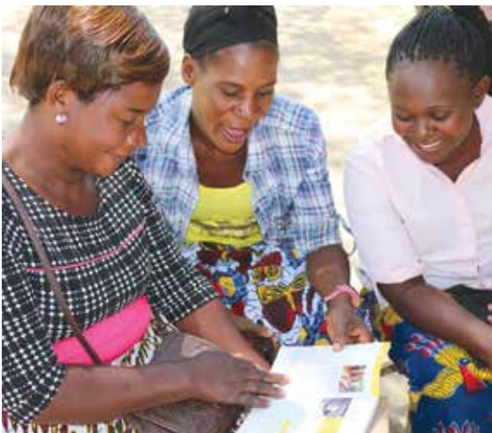
Members of the Matala Women's Group in Zambia learn delicious and nutritious ways to integrate soy and groundnuts into their cooking with recipe books provided by WIMAC.

“ASI’s approach to gradual and sustainable improvement in the lives of so many women and men is both rigorous and inspiring.”