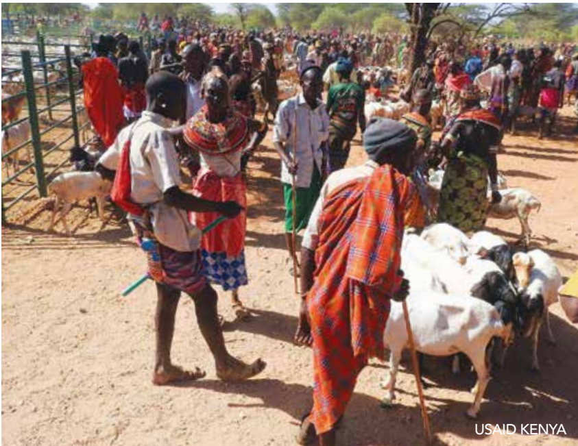
REGAL-AG worked with local partners to renovate 12 livestock markets and reignite economic growth among communities in Kenya's arid lands.

After the refurbishments, community members launched new business ventures, taking advantage of increased economic activity to work as translators, brokers, and transporters. By drawing on 50 years of experience linking value chain players, ACDI/VOCA incentivizes entrepreneurs by analyzing and balancing market forces, motivations, context, and constraints to identify efficiencies and maximize benefits for comprehensive change.