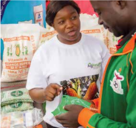
An AgResults Zambia seed seller explains the benefits of growing and eating vitamin A-rich “orange” maize to a customer.